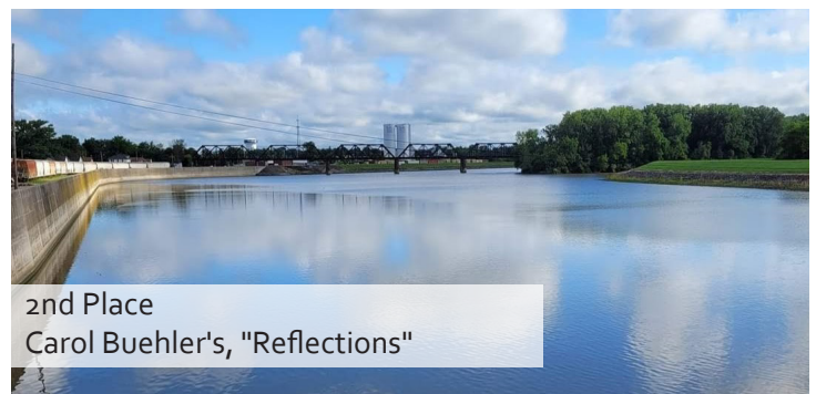
2nd Place Carol Buehler's, "Reflections"