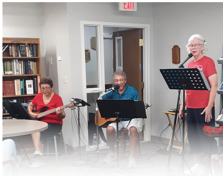
The group Open Hearts will perform holiday music Dec. 16 at 12:15 p.m. at Clyde Center.

Metro Silver Sneakers video workouts —Almost daily! Video workouts from YouTube are chosen by residents/attendees. They can be low or high-intensity workouts. Attendees decide!